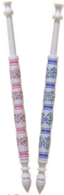
From left: Foxtrot Pink £23.50 Foxtrot Blue £23.50