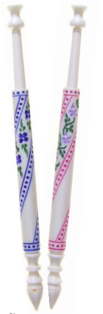
From left: Tapestry £23.50 Frieze £23.50