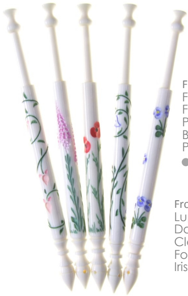
From left: Fuchsia £17.10 Foxgloves £20.95 Poppies £18.95 Bellflower £16.95 Pansies £19.75