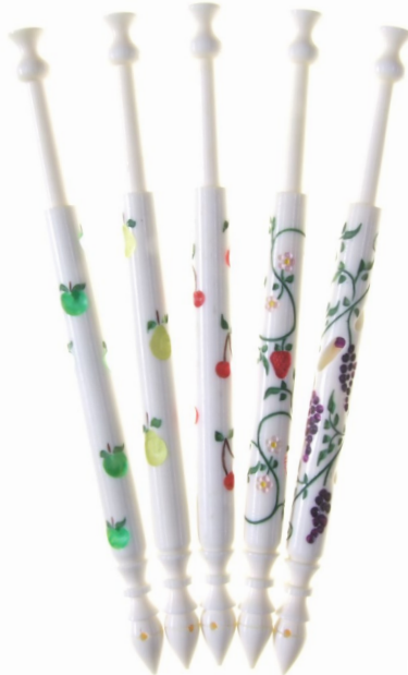
From left: Apples £16.95 Pears £16.95 Cherries £17.60 Strawberries £24.25 Grapes £26.95