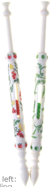
From left: Tumbling £28.95 Tomatoes £28.95 Peas £28.95