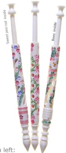
From left: Sweet Pea Profusion £31.75 Passion £27.25 Busy Bees £31.95