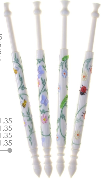
From left: Bees £21.35 Butterflies £21.35 Caterpillars £21.35 Ladybirds £21.35