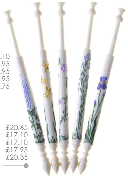
From left: Lupins £20.65 Daffodils £17.10 Clematis £17.10 Forget-me-Not £17.95 Iris £20.35