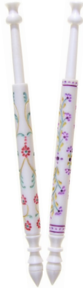
From left: Serenity £22.60 Daydream £22.75