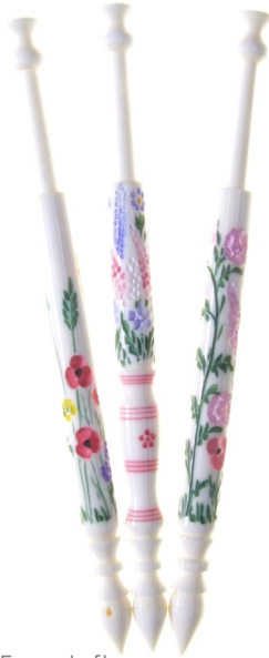
From left: Wild Garden £26.25 Vase £25.95 Cottage Garden £26.25