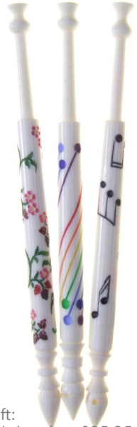
From left: Brambleberries £25.95 Rainbow £17.95 Music Notes £18.95