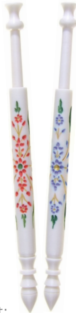
From left: Rhapsody Red £25.25 Rhapsody Mauve £25.25