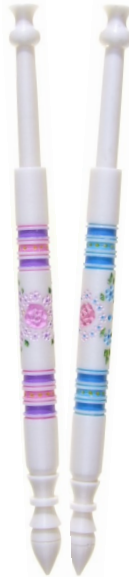
Centrepiece In Mauve or Aqua £24.95