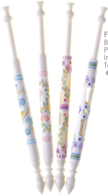
From left: Blue Paradise £23.95 Pink Paradise £23.95 Indian Summer £29.95 Temptation £26.25