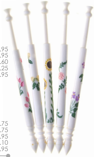
From left: Tulips £17.75 Acorns £17.75 Sunflowers £17.95 Roses £17.10 Violets £19.95