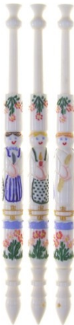
Rub-a- Dub Dub £49.95

Row, row, row your boat, gently down the stream, Merrily, merrily, merrily, life is but a dream.