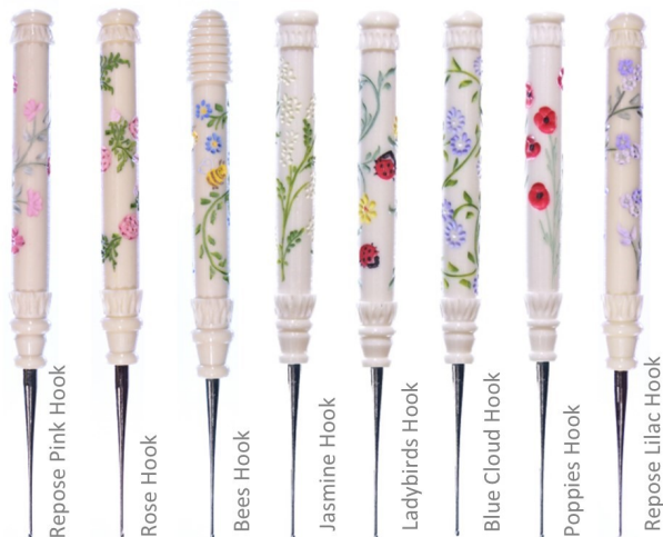
Repose Pink Hook

Including handles, all divider pins are approximately 100mm (4") long.