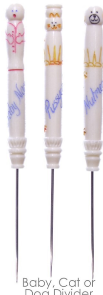
Baby, Cat or Dog Divider pins inscribed with your name of choice. £29.95